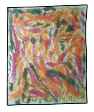
Detail image of artwork