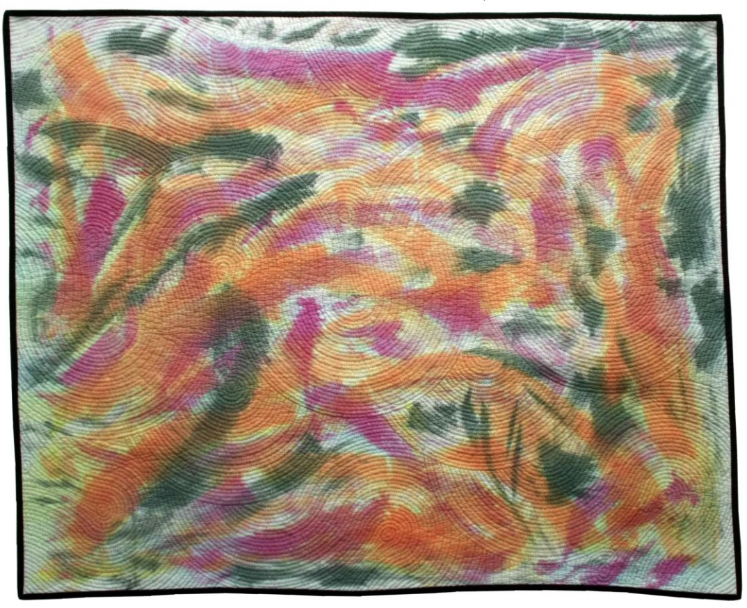
Exhibition and Publication History